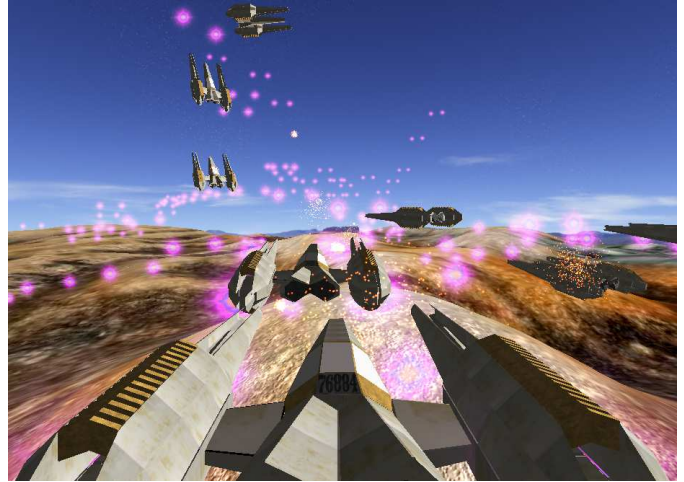
Fig. 1. A screenshot of Planet \pi 4

We propose a benchmark platform for the evaluation of peer-to-peer gaming overlays that brings the two approaches together. The platform is based on the 3D multiplayer space-shooter Planet \pi 4 [4]. A key feature of our system is the ability to run the game both as a standalone application using the real network and in a discrete-event simulation on a virtual network. Hence, it is possible to evaluate an overlay in a discrete-event simulation with a workload generated by autonomous players (bots) and to validate the results with the prototype deployment using a real network. In addition, our system provides the possibility to replace the peer-to-peer overlay implementation in order to compare different overlays. For the demonstration an implementation of pSense is used to show the two main functionalities of our system.